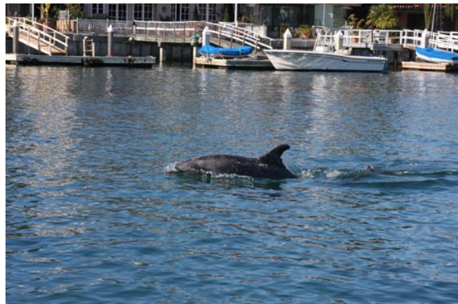
Dolphins at Newport.

Crystal Cove was a location for another study known as “night watch”. It was performed in 2003 and focused