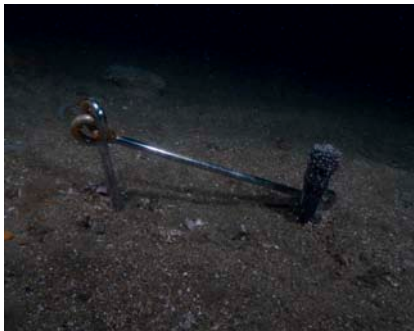
Deployed thermograph

To speed the development of the array, the CMS is instituting a new program called “Adopt-A-