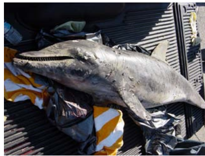
Dead dolphin from Newport Bay.

around the harbor to encourage the public to keep an eye out and note when dolphins were sighted. Much of the data were from public sightings as well as from the Harbor Patrol officers. When sightings occurred, data were collected to determine what the dolphins were doing in the harbor and if there were any patterns. The data collected included time, tidal level, number of dolphins, location, behavior, and presence of juveniles. Unfortunately CDSP lacked the funds for proper