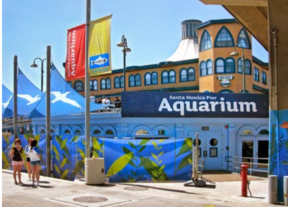
Heal the Bay Aquarium

Volunteers perform valuable tasks such as actually walking the streams in the watershed, noting and photographing sources of pollution and other problems while using high-end GPS units to locate precisely the phenomenon. The Stream Team can also mechanically remove invasive species. This is in addition to the data collections described above. These activities would be cost prohibitive for paid staff of governmental organizations.