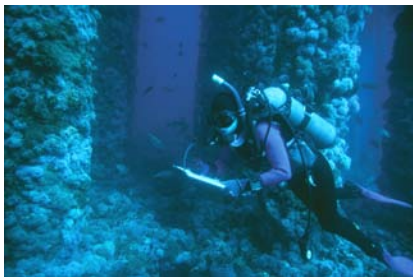
Oil platform census.

On a trip to the Channel Islands have you ever wondered what was underneath the boat? The distance from Ventura to Anacapa Island is less than 20 miles. If the underwater topography varies on the same spatial scales as that found on land, then consider what wonders you are travelling over as you make your way to the islands. If you travel 20 miles in any direction from where you are now, you will discover many biomes and environmental niches, besides a great number of natural wonders. Hence, you would expect many interesting things under your boat. One of these