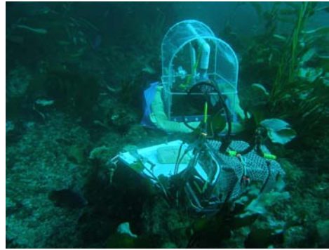
DO sensor in kelp.

has recently been discovered: asphalt volcanoes. Located at the bottom of the Santa Barbara Channel over 200 m in depth, the asphalt structures are the results of oil seepage, similar to